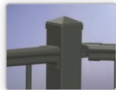
Top Rail Bracket (PTP) Level & Top Rail "Multi-Angle" Bracket (PTP) Level