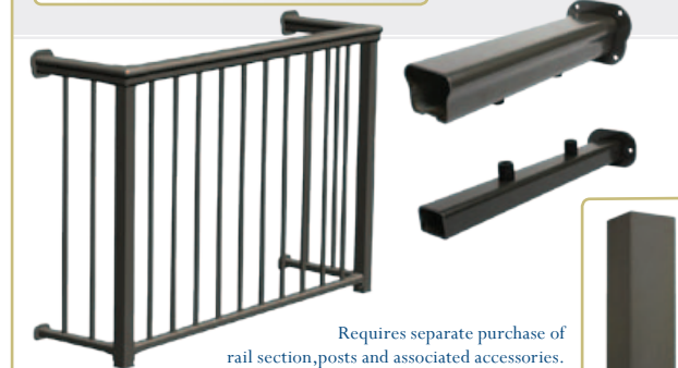
French Balcony Conversion Kit

Requires separate purchase of rail section, posts and associated accessories.