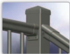
Top Rail Bracket (PTP) Level & Top Rail "Fixed-Pitch" Bracket (PTP) Stair