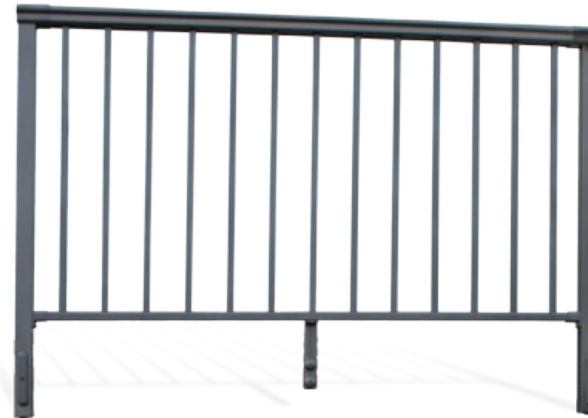
Over The Post (OTP) Side/Fascia Mount