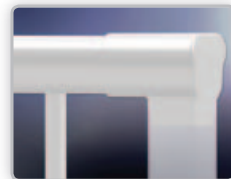
Top Rail End Bracket (OTP) Level