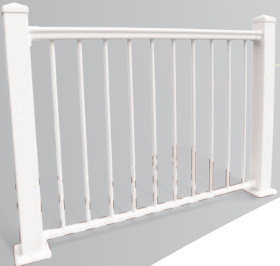
Post To Post (PTP)

ALUMINUM Solutions by FAIRWAY RAIL SYSTEMS WWW.SOLUTIONSALUMINUM.COM