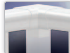
Top Rail 90° Bracket (OTP) Level