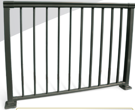
Over The Post (OTP) Surface Mount